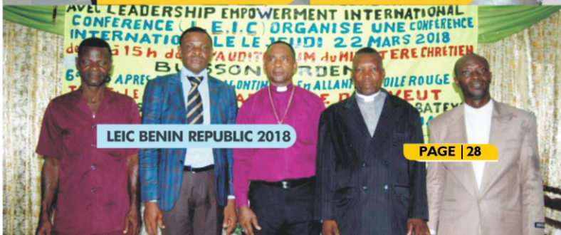
LEIC BENIN REPUBLIC 2018