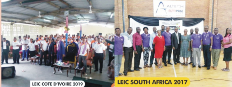
LEIC COTE D'IVOIRE 2019