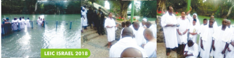
LEIC ISRAEL 2018