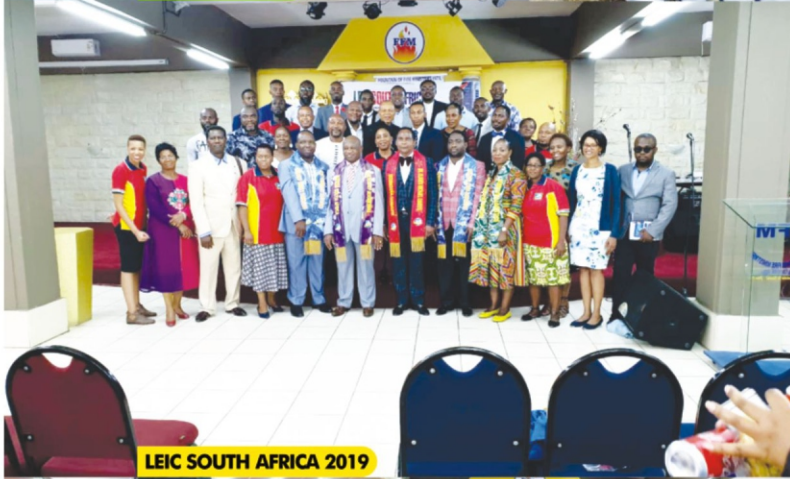
LEIC SOUTH AFRICA 2019