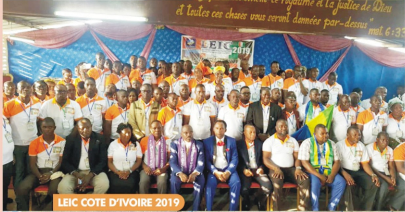
LEIC COTE D'IVOIRE 2019