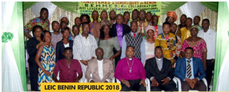
LEIC BENIN REPUBLIC 2018