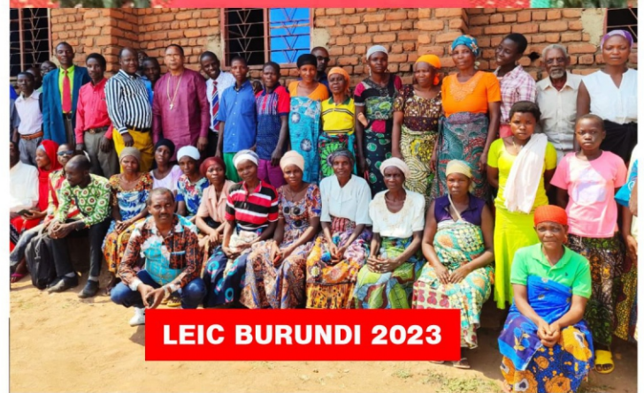
LEIC BURUNDI 2023