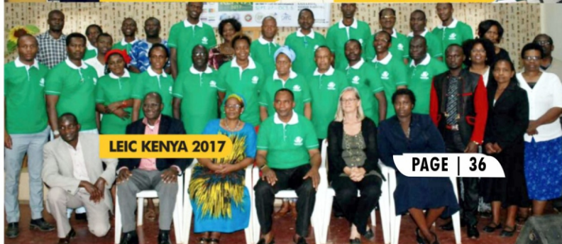
LEIC KENYA 2017