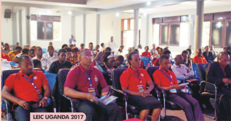
LEIC UGANDA 2017