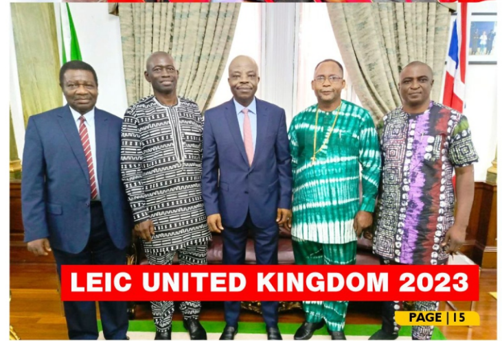
LEIC UNITED KINGDOM 2023