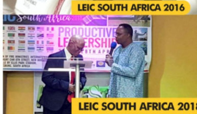
LEIC SOUTH AFRICA 2018