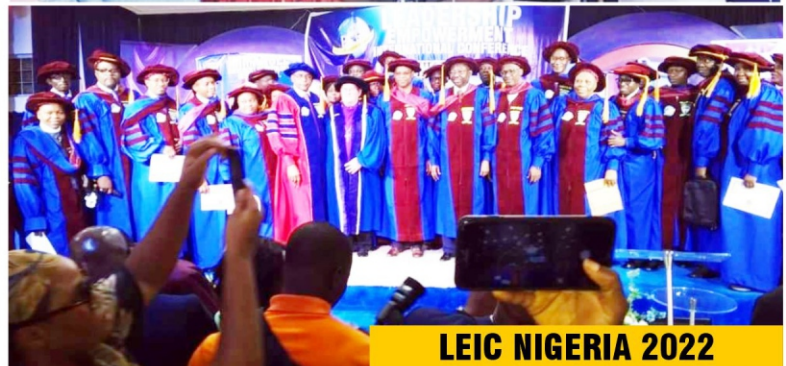
LEIC NIGERIA 2022