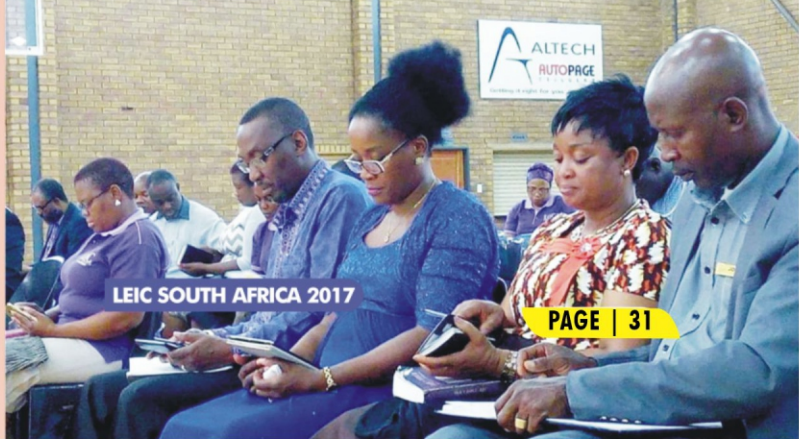
LEIC SOUTH AFRICA 2017