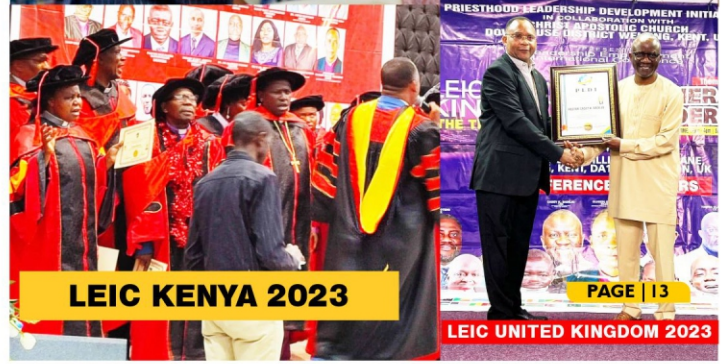
LEIC KENYA 2023