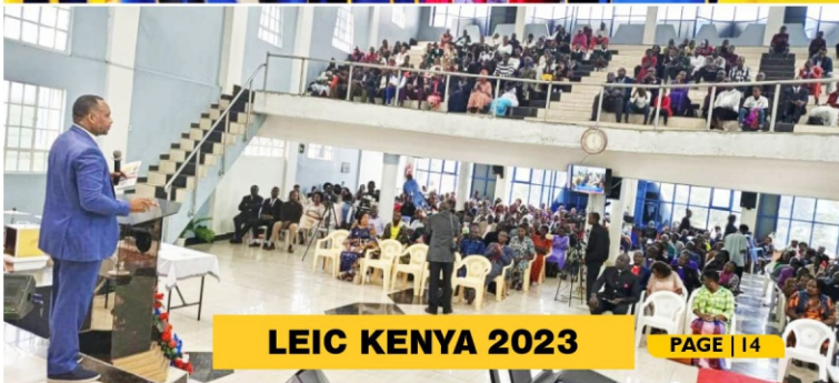
LEIC KENYA 2023