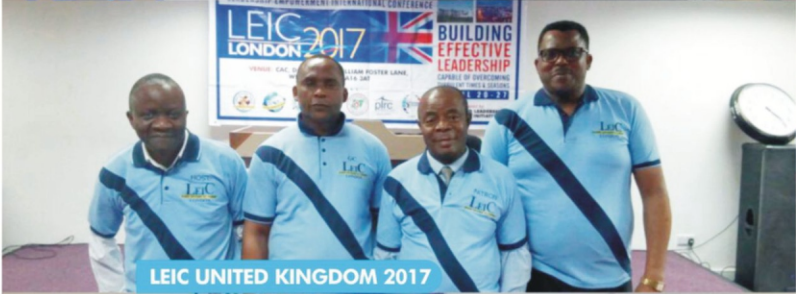
LEIC UNITED KINGDOM 2017