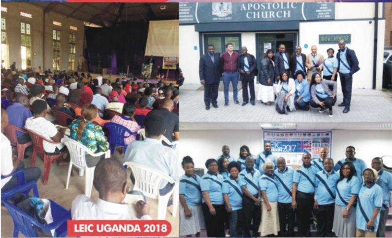
LEIC UGANDA 2018