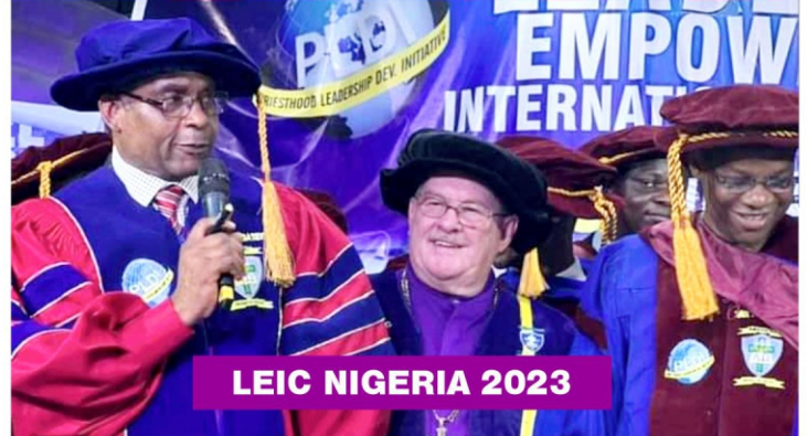
LEIC NIGERIA 2023