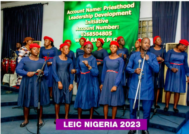
LEIC NIGERIA 2023