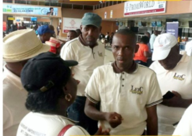
LEIC SOUTH AFRICA 2016