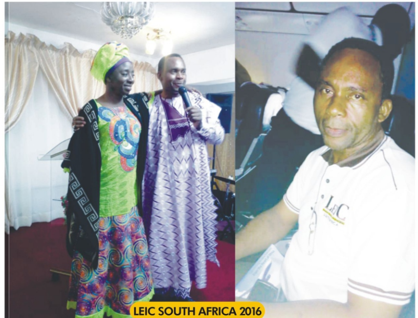
LEIC SOUTH AFRICA 2016

AUSTRALIA & PACIFIC OCEAN COUNTIRES CHRIST APOSTOLIC CHURCH (PRAISE CENTRE) +61 450 601 656, +61 420 937 909 P.O. Box 445, Bankstown NSW 1885, Australia