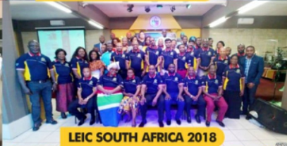
LEIC SOUTH AFRICA 2018