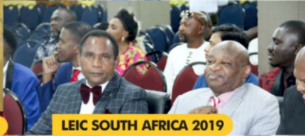
LEIC SOUTH AFRICA 2019