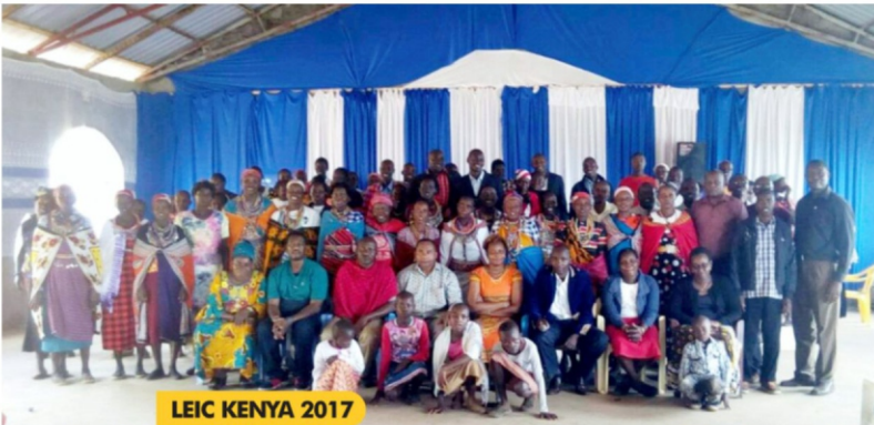
LEIC KENYA 2017

PLDI has been born at such a time as this,