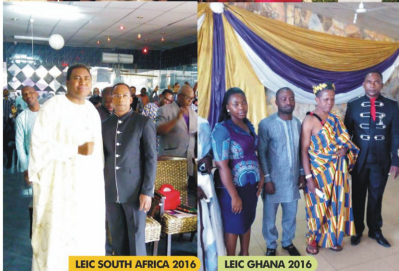
LEIC SOUTH AFRICA 2016