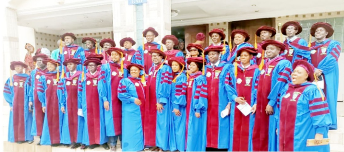
LEIC NIGERIA 2022 GRADUATION