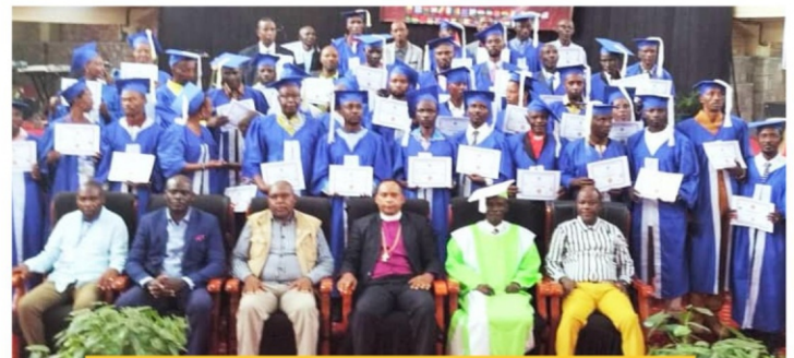
LEIC BURUNDI GRADUATION 2023