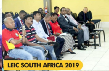
LEIC SOUTH AFRICA 2019