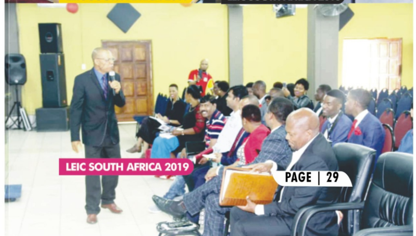
LEIC SOUTH AFRICA 2019