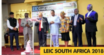
LEIC SOUTH AFRICA 2018