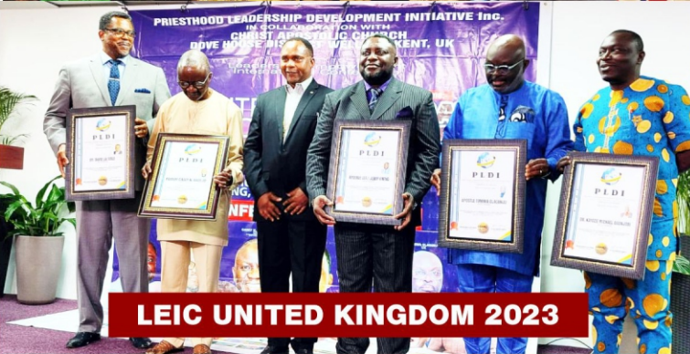
LEIC UNITED KINGDOM 2023