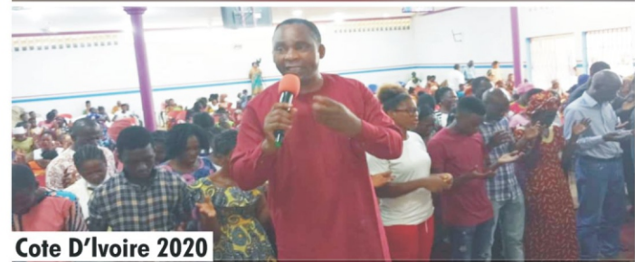
Cote D'Ivoire 2020