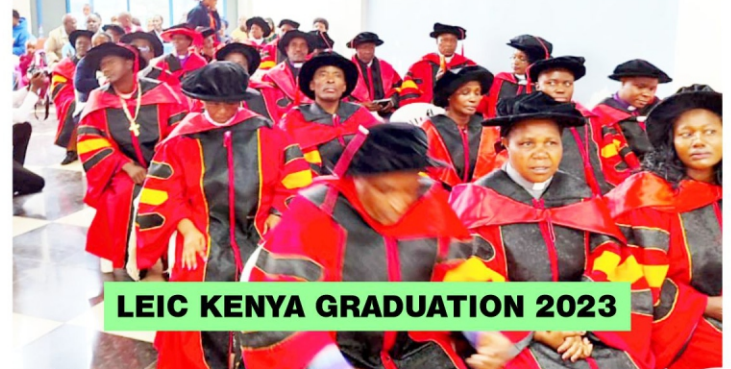
LEIC KENYA GRADUATION 2023