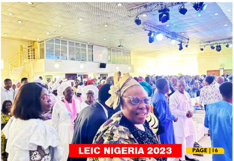
LEIC NIGERIA 2023