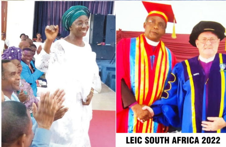
LEIC SOUTH AFRICA 2022