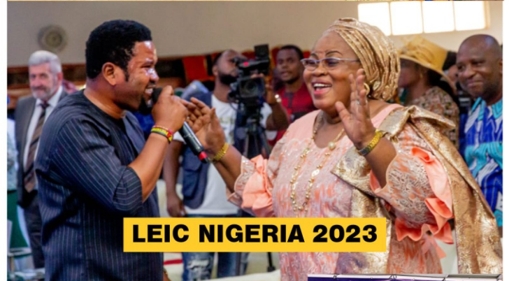
LEIC NIGERIA 2023