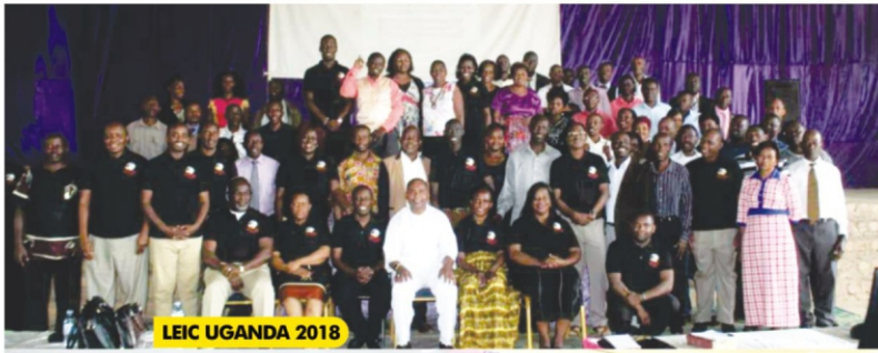
LEIC UGANDA 2018