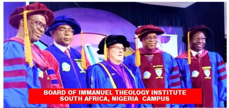
BOARD OF IMMANUEL THEOLOGY INSTITUTE SOUTH AFRICA, NIGERIA CAMPUS