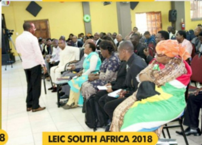
LEIC SOUTH AFRICA 2018