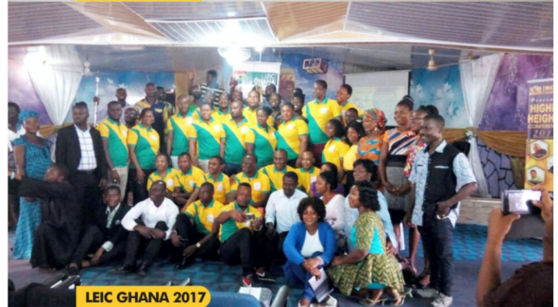
LEIC GHANA 2017