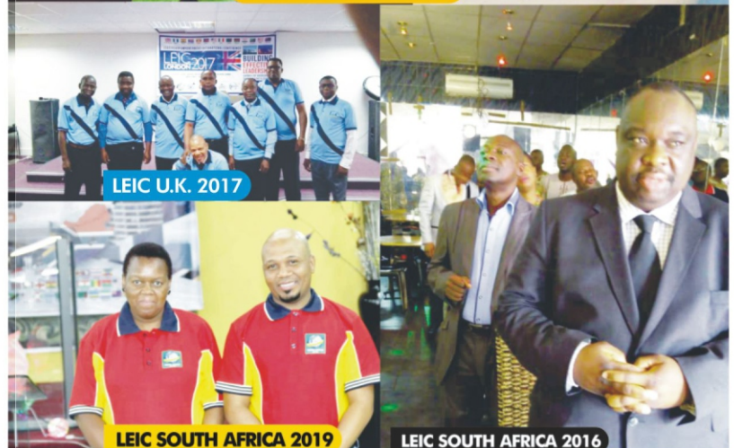
LEIC U.K. 2017