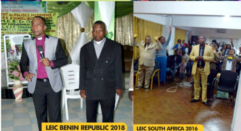
LEIC BENIN REPUBLIC 2018