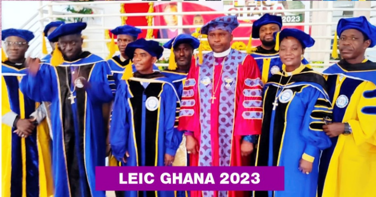
LEIC GHANA 2023