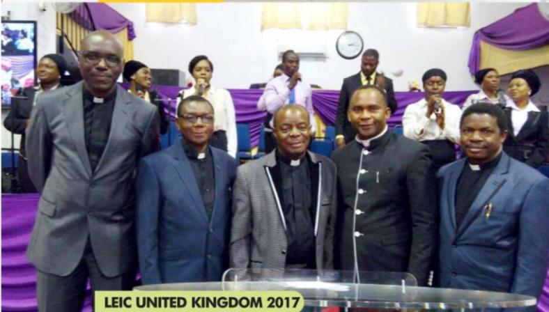
LEIC UNITED KINGDOM 2017