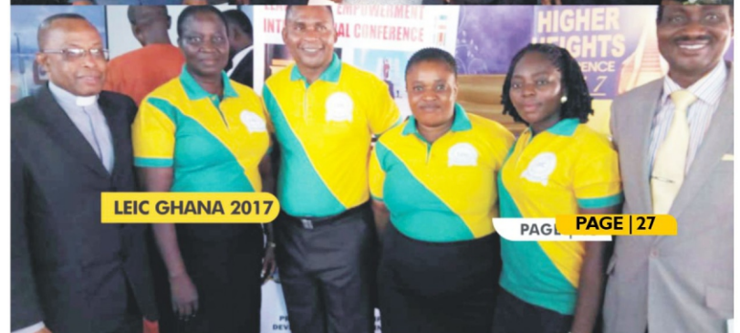
LEIC GHANA 2017