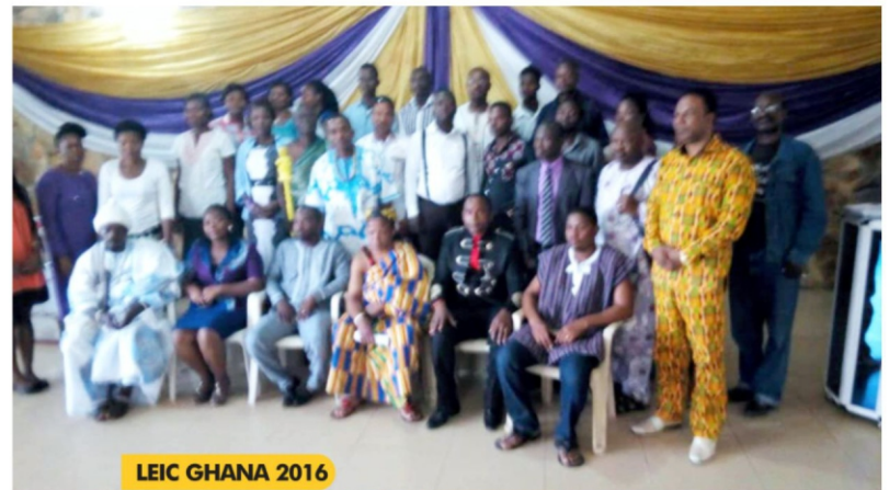
LEIC GHANA 2016

LEIC is a leadership arm of PLDI. God has strategically positioned LEIC as a leadership ministry of PLDI. It is a unique opportunity and a privilege that comes with a special grace, the grace to give, to partner with God for the expansion of His kingdom through networking. We are helpers of the war, sustaining Moses' raised hands with high finance and conferences that enable the gospel to reach the whole world, appropriating new technology that have narrowed geographic boundaries and turned the