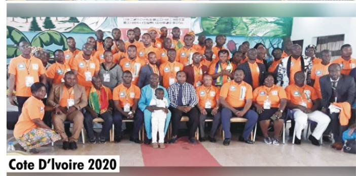
Cote D'Ivoire 2020