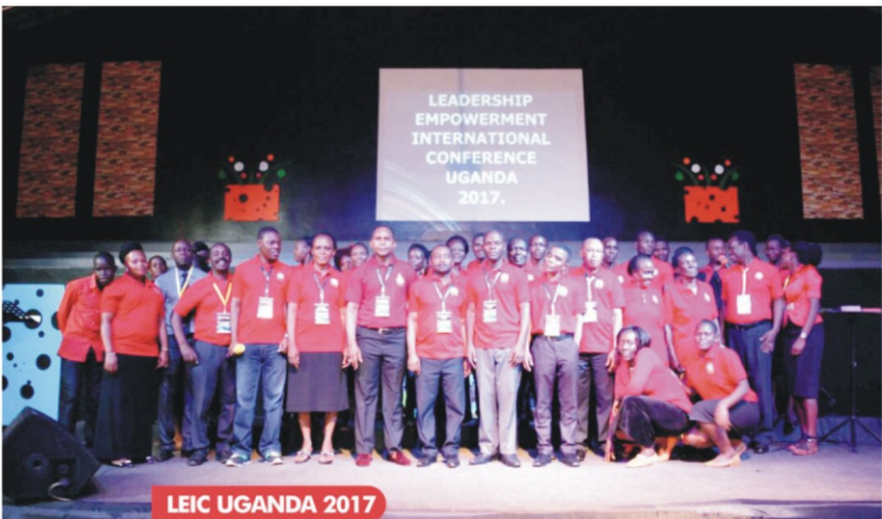
LEIC UGANDA 2017