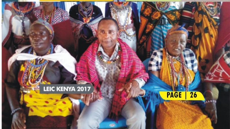
LEIC KENYA 2017