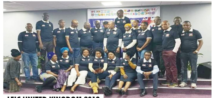
LEIC UNITED KINGDOM 2019