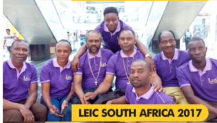
LEIC SOUTH AFRICA 2017