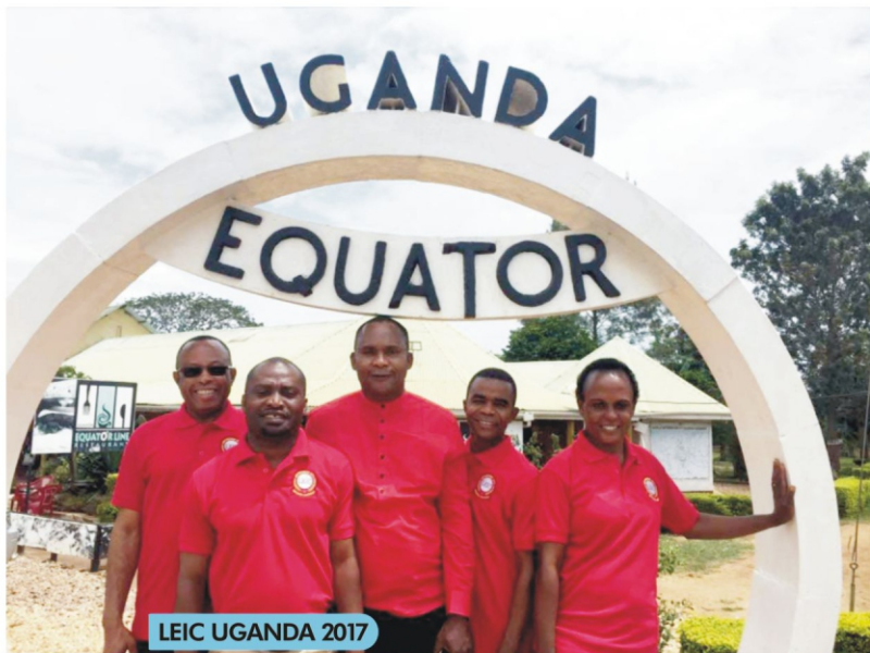
LEIC UGANDA 2017